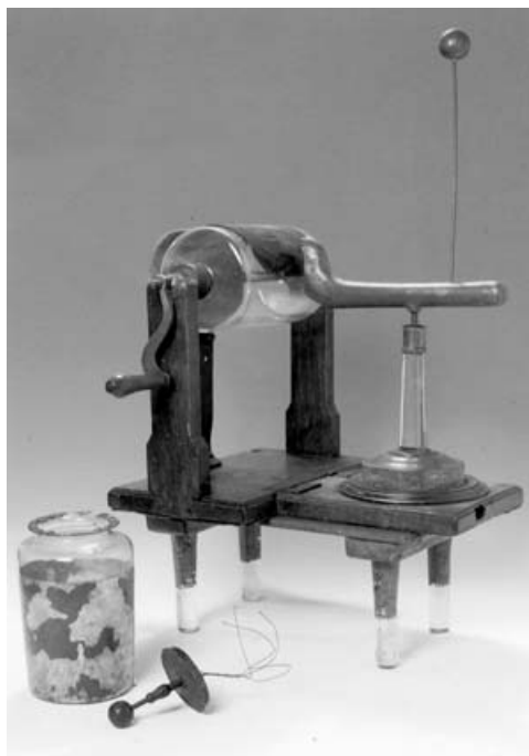
Figure 2. One of Wesley's portable electrical machines. The glass cylinder is about 30 cm in length and 11 cm in diameter. The metallic conductor is about 25 cm long. From Wesley's Chapel and Museum in City Road, London.

studies have demonstrated, Newton's religious heterodoxy and his anti-Trinitarian inclinations were no secret to his contemporary readers. In particular, the diffusion of Newtonian experimental philosophy by means of public lectures and demonstrations was perceived by the High Church as a perilous threat to its hegemony. 73 During his years at Oxford, Wesley became acquainted with John Hutchinson's opposition to Newton's natural philosophy and with his alternative Trinitarian cosmology based on the elements of air, light and fire as three modifications of one created ether. 74 Although the influence of Hutchinson on his works changed in the course of time, Wesley was attracted to his insistence on the Bible as the only source of true knowledge, which remained a constant theme in his works. 75 In the mid-eighteenth century the electric fire began to be incorporated in such Trinitarian cosmologies. Freke's Essay to Shew the Cause of Electricity provided a Trinitarian interpretation of the electric fire, adapting